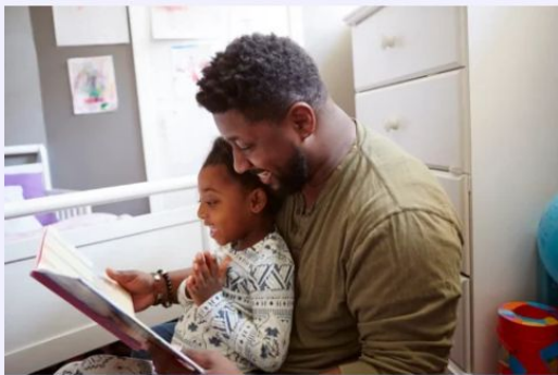
Share stories together

Click here for tips on sharing stories together. Advice is available in 22 different languages, including this one in Pashto.