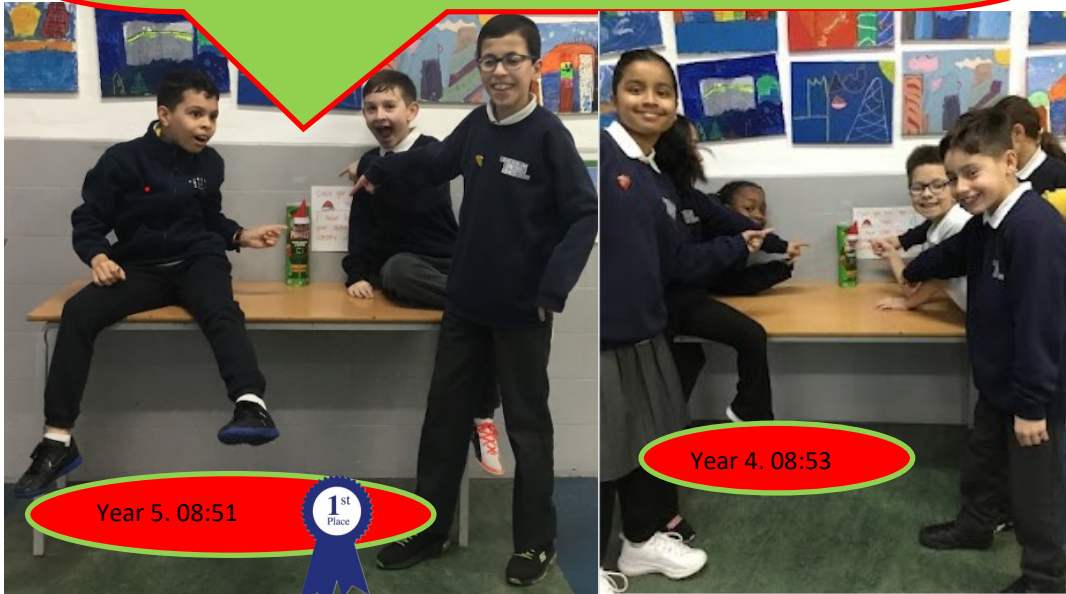
Year 5. 08:51

Once you pop you can't stop. I loved being in your school. 'Happy Holidays'