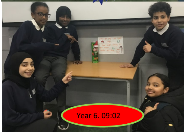
Year 6. 09:02